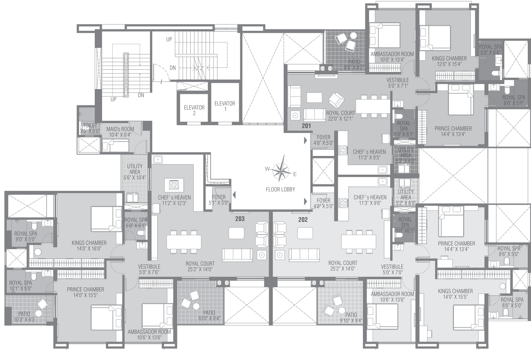
B WING 2,4,6,8,10 & 12 TYPICAL EVEN FLOOR PLAN

Plan shown with enclosed balcony for which the area is mentioned separately on the area chart.